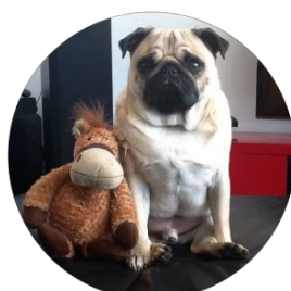
APARTMENT DWELLER SINCE 2009