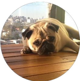
QUIET & LAZY

Being a home owner myself, I can understand and appreciate any owners concerns regarding companion animals. I can advise with confidence, should a rental property be leased to me, I will look after it, keeping it secure, clean and tidy. Most importantly, I commit to taking responsibility for my dog, ensuring others are not adversely affected by the companionship he provides me.